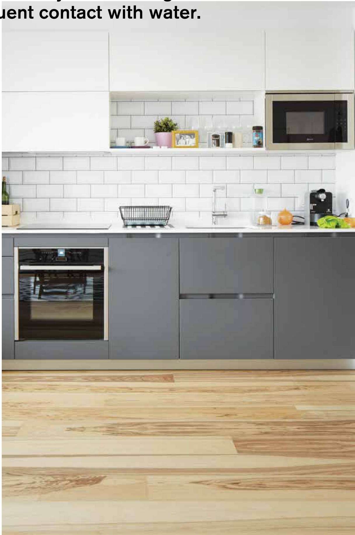
Wood: Olivier Ash

The moisture resistant surface treatment, applicable to all surface finishes and woods, allows the installation of Hy Tek flooring in areas with frequent contact with water.