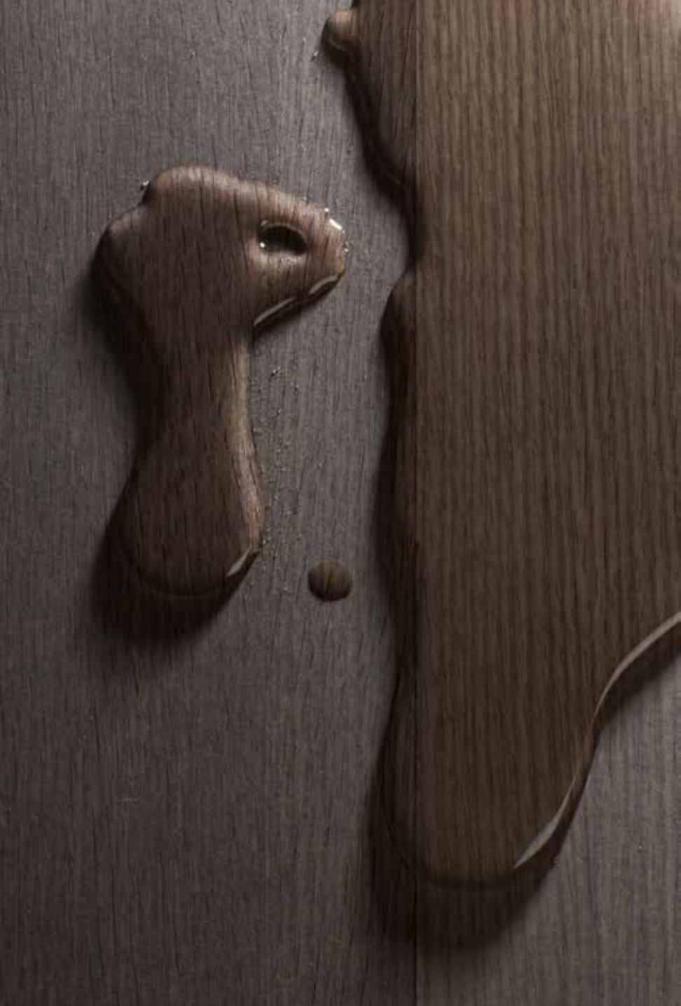
Wood: Smoked Grey Oak

With lesser light refraction than a glossy finish, it presents a smooth and easily cleaned surface. Recommended for high-traffic public spaces.