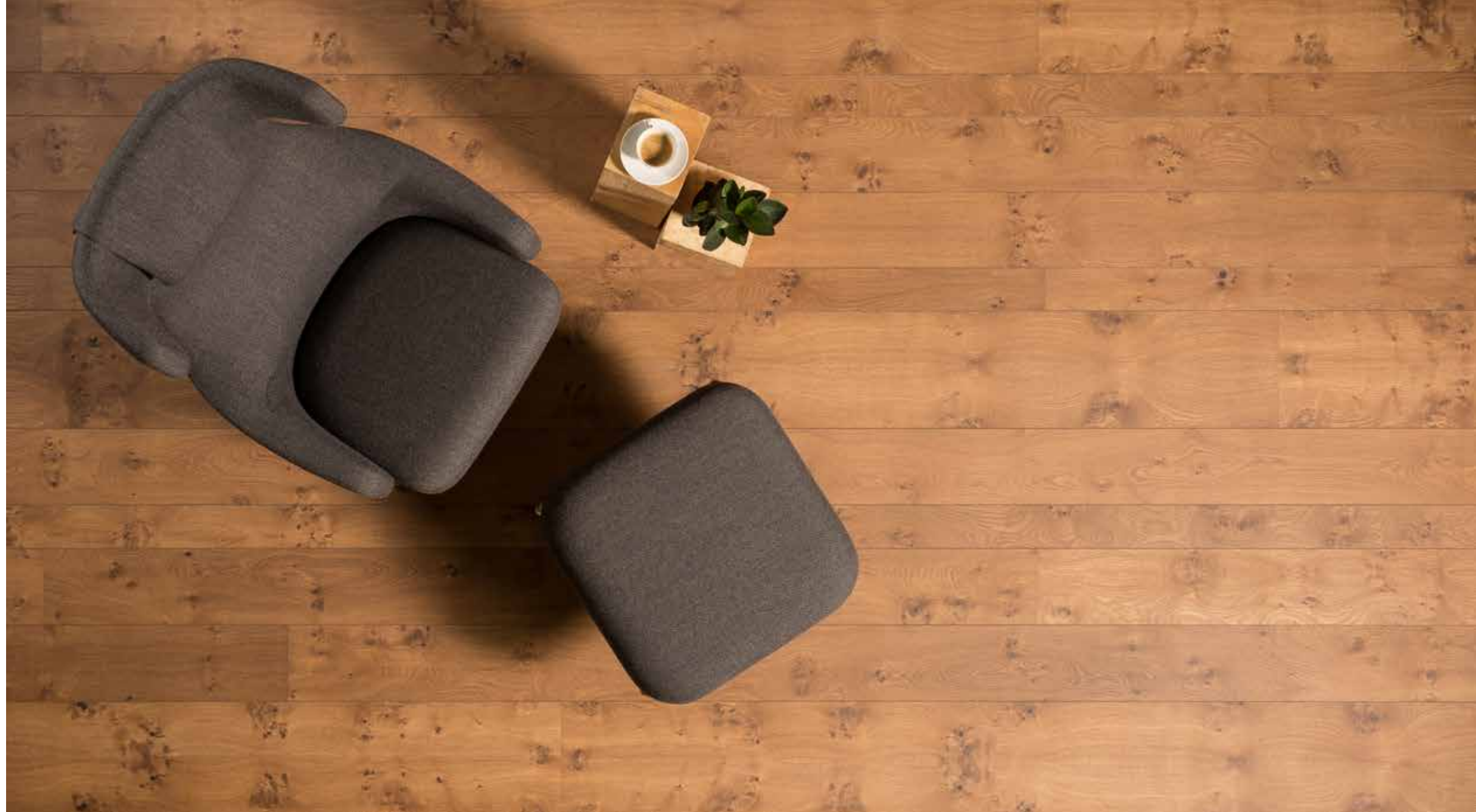
Wood: Rustic Oak

Slats with different widths can be combined (2 or 3 widths). Assembly with narrow slats of 107 mm implies that all slats are produced with bevelled edge.